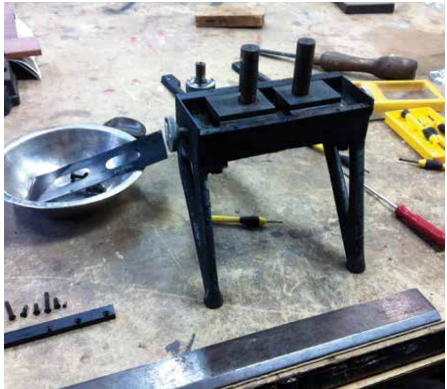
Eikanometer being stripped and realigned