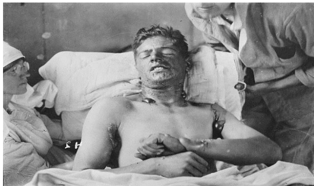
A Canadian soldier with mustard gas burns, ca. 1917-1918