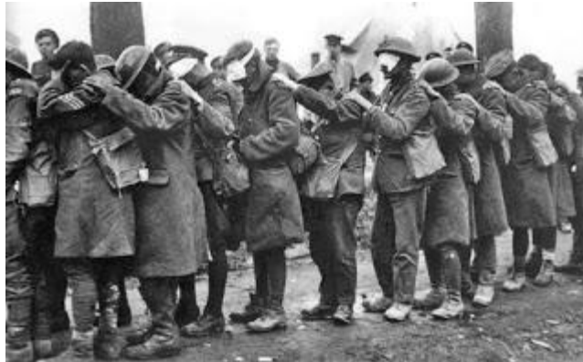
Soldiers from the British 55th (West Lancashire) Division temporarily blinded by tear gas near Bethune during the Battle of Estaires, April 10, 1918.